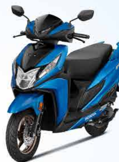
MAT MARVEL BLUE METALLIC