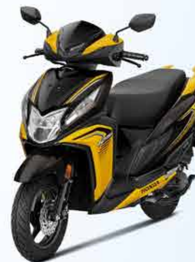
PEARL SPORTS YELLOW