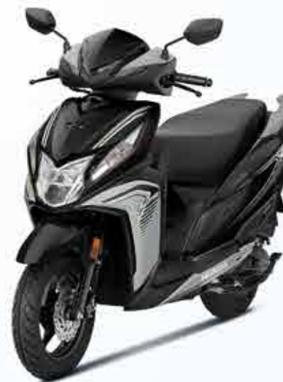
PEARL DEEP GROUND GRAY (STRIPE)