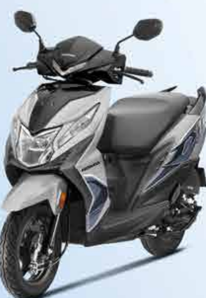
PEARL IGNEOUS BLACK + PEARL DEEP GROUND GRAY