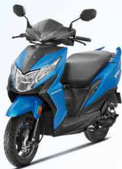
MAT MARVEL BLUE