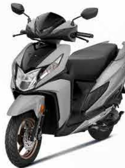
PEARL DEEP GROUND GRAY (EMBLEM)